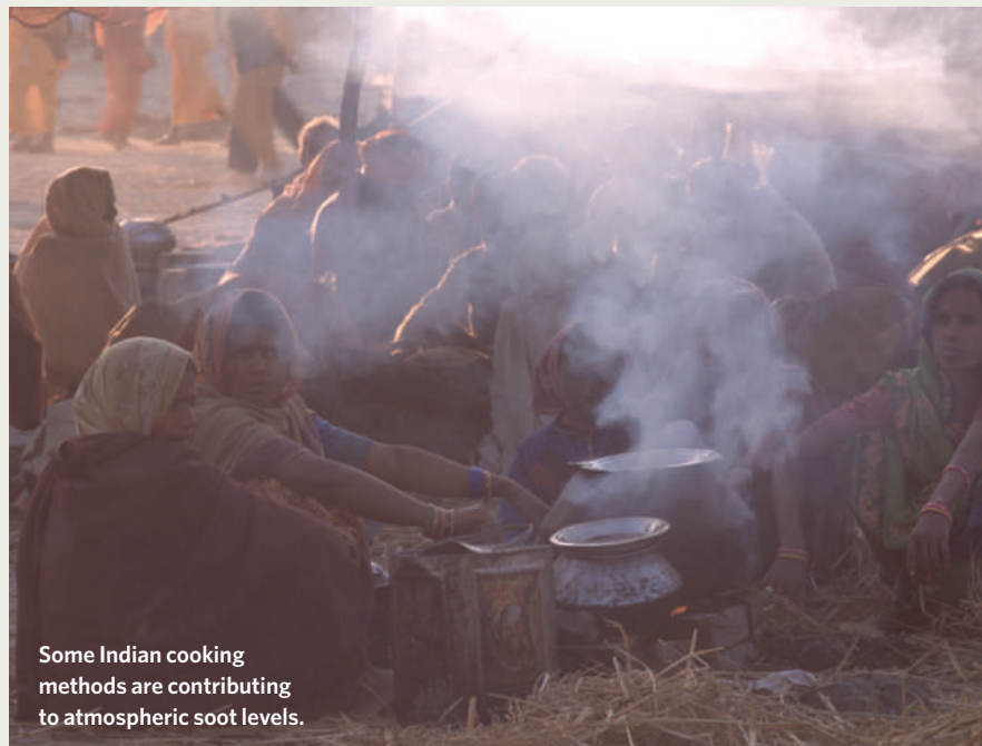
Some Indian cooking methods are contributing to atmospheric soot levels.